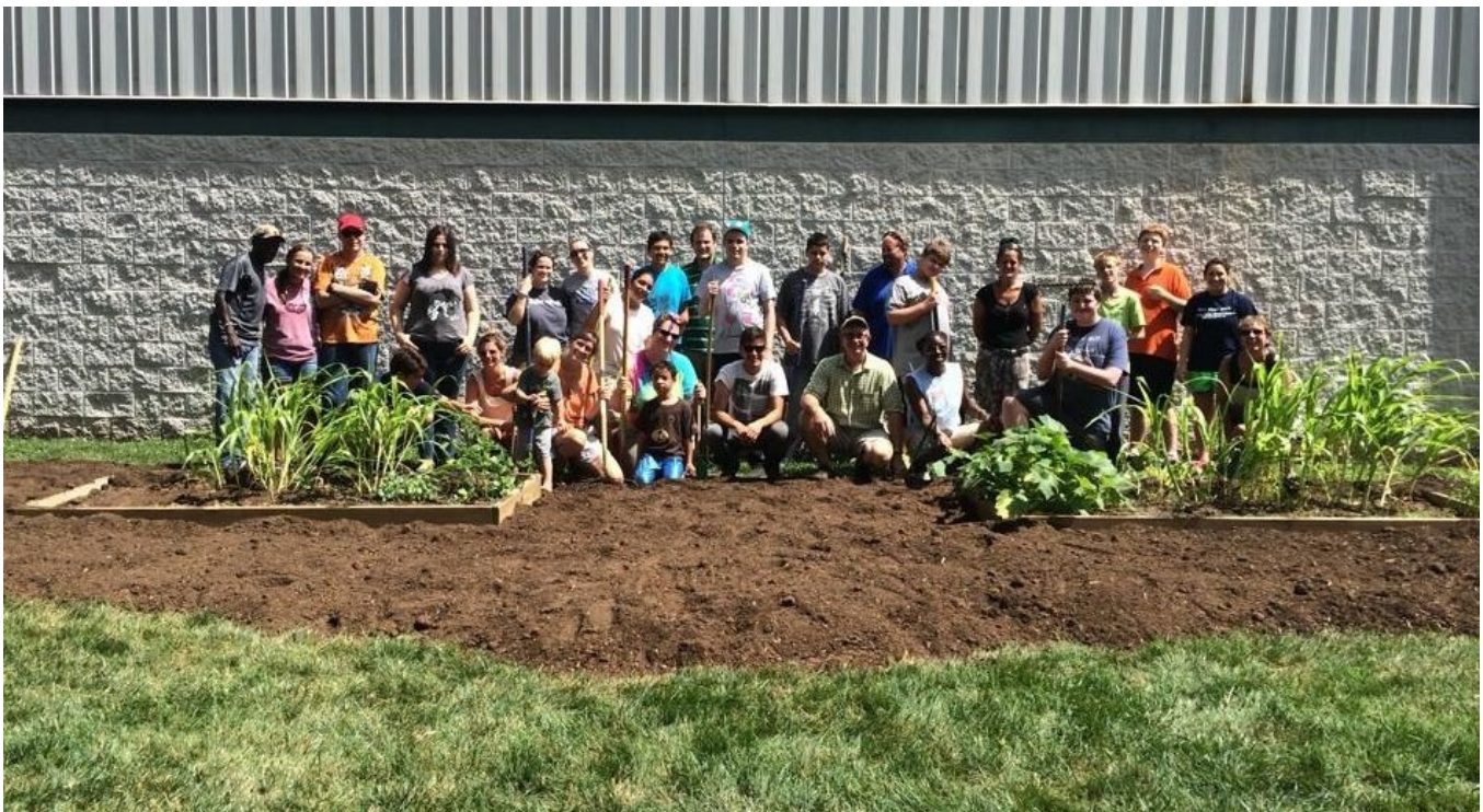
Figure 1: The ground-breaking crew, June 2014.

During Kentucky's hot, dry summer months (June, July, and August), groups from around the community helped keep the garden weeded and