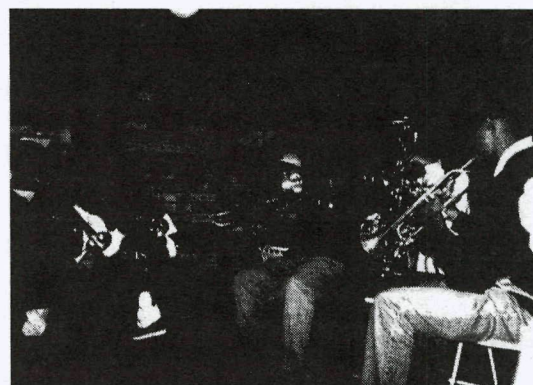
A party after the conference in Cape Town. The band instruments were furnished by the Biehls.

to the Biehls' first article was a willingness to extend more power to readers, providing access to people whose ideas might differ from that of the authors. Of course that is exactly what occurred. Some of the commentators questioned the Biehls' motives and actions; some were in wholehearted support. But whatever the position, the reader was invited not to privilege any one position, but to reflect on the ideas expressed and to gain new knowledge. And knowledge is power. The Biehls' willingness to accept the conditions under which their story would be told was in keeping with what Amy would have wanted, and reflected her openness to minimizing others' control over peoples' lives.